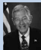
Sen. George Voinovich

Keynote Speaker U.S. Senator George Voinovich