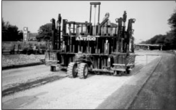
Antigo multiple head breaker is used to break and seat existing PCC pavement.

ODOT Project 631-99, Ham-126-23.1734, rehabilitation of the eastern section of the Ronald Reagan, Cross County Highway through the cities of Montgomery, Blue Ash, Amberly Village and Reading is under construction and includes the first rehabilitation of a concrete pavement by the break and seat and asphalt overlay method that the ODOT has done in many years.