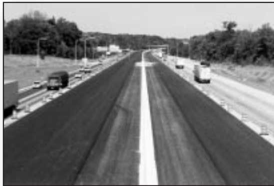
Full depth HMA lane addition and resurfacing of existing full depth asphalt pavement on I-71 in Delaware County by Kokosing Construction Company.

Cinci to Cleveland, continued on page 11