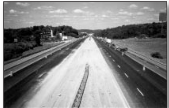
Full depth HMA lane addition with milling HMA surface, joint repair and new HMA overlay on existing PCC pavement in Warren County by Valley Asphalt Corporation.