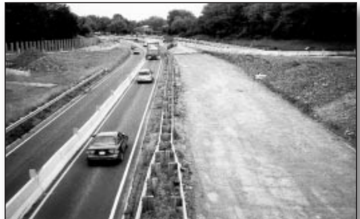
In order to maintain clearance under structures, the existing PCC pavement is being removed and replaced with full depth asphalt.

The contractor, John R. Jurgensen Co., submitted a value engineering proposal on the project to change the maintenance of traffic scheme to save $87,000 and two weeks of time.