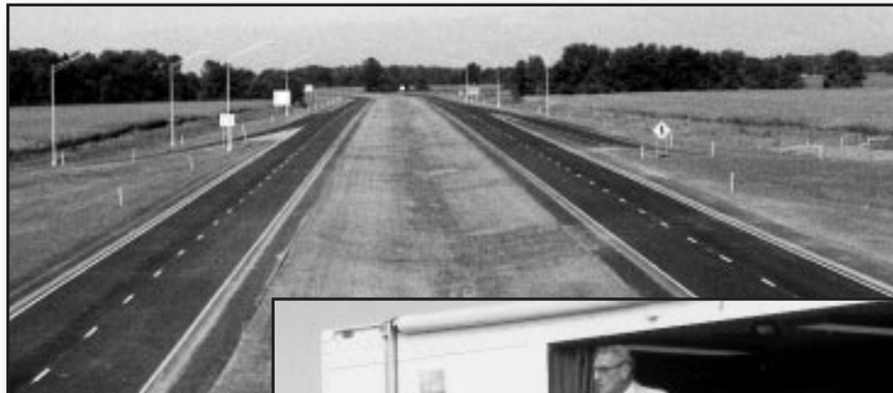
Relocated US Route 35 in Greene County looking west from SR 72. Prime contractor was Smith and Johnson with FPO member Valley Asphalt as the subcontractor placing the full depth asphalt pavement.

Ohio has one of the finest transportation systems anywhere thanks to the leadership and hard work of the Ohio Department of Transportation, counties and local jurisdictions.