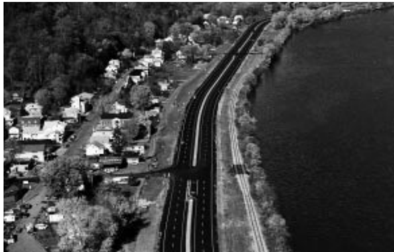
S.R. 7 in Monroe County, the first ODOT project to include a warranty, was constructed by Shelly & Sands in 1997.

In addition, at least 10% of ODOT's dollar program shall be for projects requiring a pavement warranty. Considering a construction-/maintenance program of about $1 billion, this translates to $100,000 worth of work.