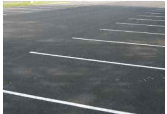
Figure 1: Parking Facility of the Mansfield Art Center, Richland County, Ohio