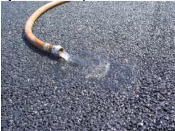
Figure 2: Permeability demonstrated

How permeable is the porous asphalt pavement (Open-Graded HMA)? Various values have been reported in the literature. All are so high relative to the percolation values of the soil as to not present any limitation and are typically not considered in design. A permeability of 6000 ft/day is attributed to Lovering and Cedergren (1). Thelen and Howe report an asphalt permeability of 176 in/hr. (352 ft/day) (2). Roseen is quoted as saying that, "if 99% clogging were to occur, the infiltration rate would still be greater than 10 inches per hour, which is greater than most sand and soil mediums." (6) In any case, these values are orders of magnitude higher than the best soil permeability of about 6 inches per hour. Figure 2 gives a visual indication of the porosity of a porous asphalt pavement surface course.